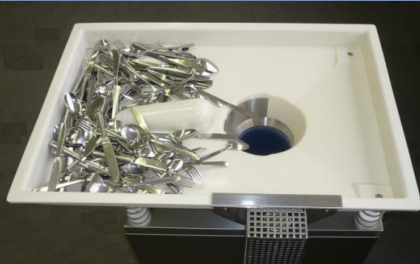
The clean and wet cutlery is given directly from the dishwasher baskets on the chute.