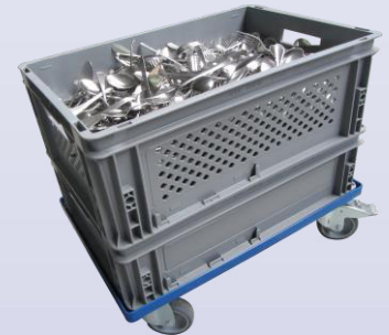
Carrier with cutlery boxes