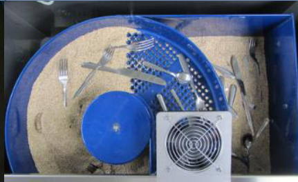
The cutlery is spirally transported upwards through a high-grade granular substance and is dried and polished. The installed ventilator prevents that granulate comes out of the machine.