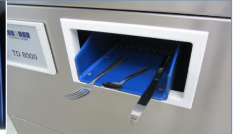
The regular use of TD 8000 FILL & GO keeps your cutlery shining.